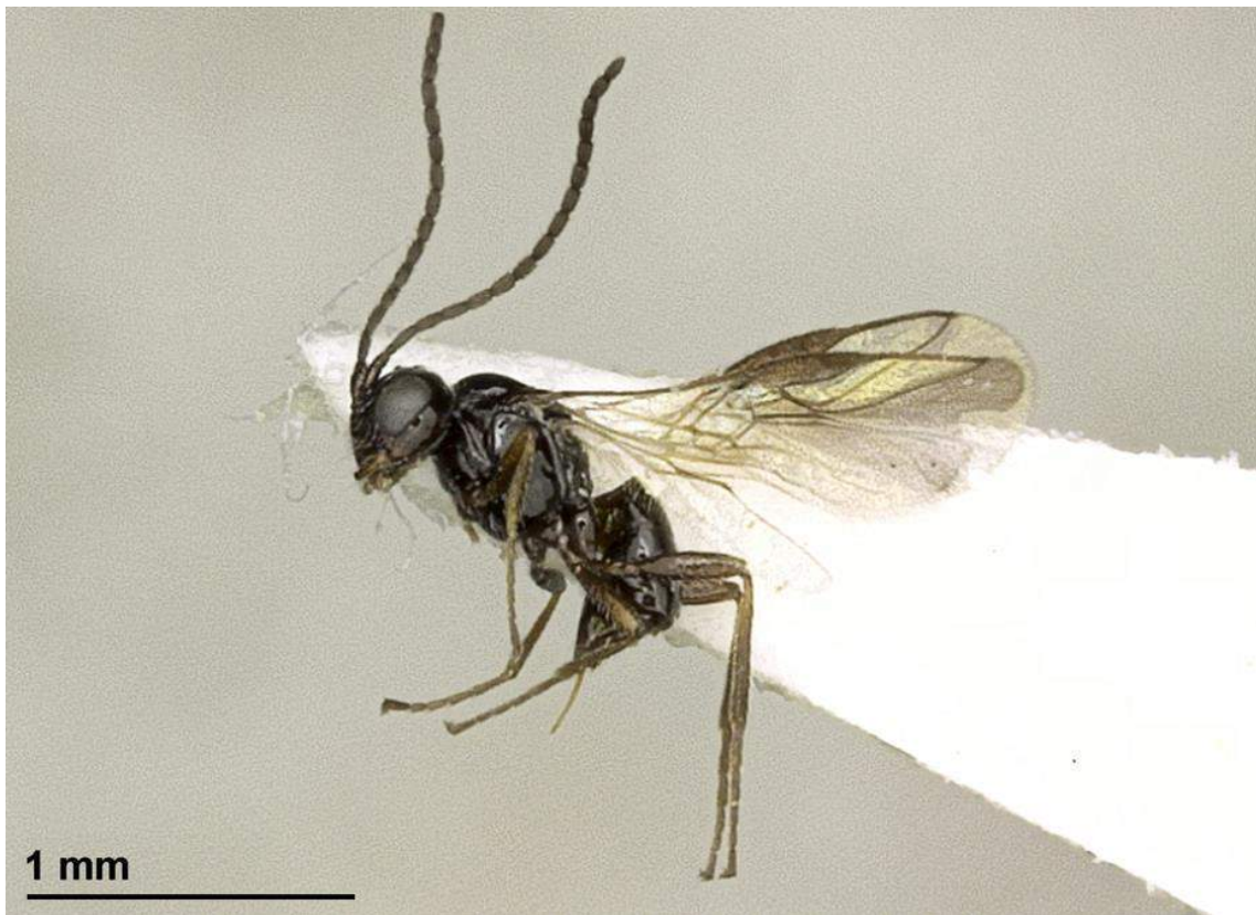
Figure 4. Phaedrotoma scaptomyzae (Fischer, 1967): habitus, lateral view (female).