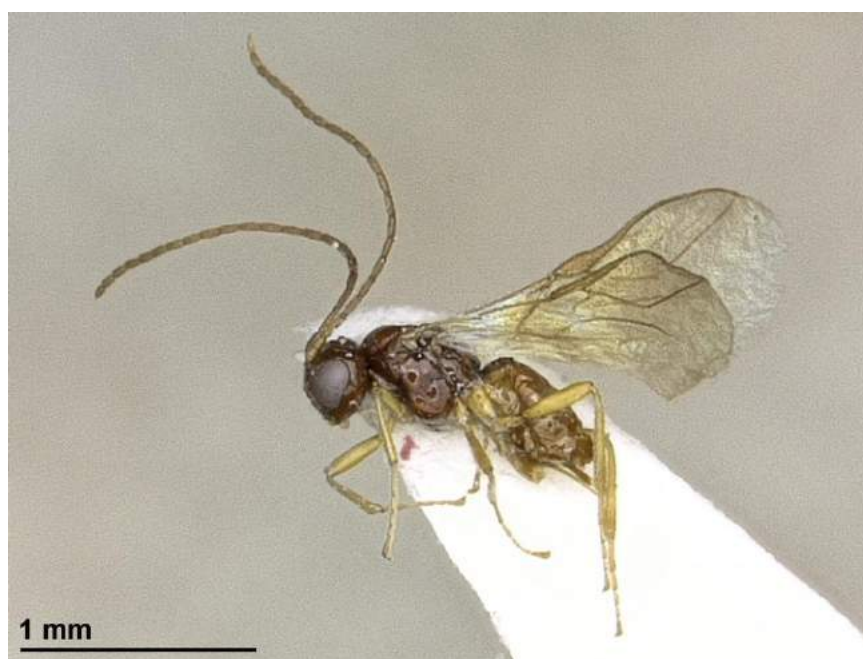
Figure 2. Opius (Cryptonastes) gracilis Fischer, 1957: habitus, lateral view (female).

Distribution in Iran: Sistan & Baluchestan (Khajeh et al., 2014) and Kerman.