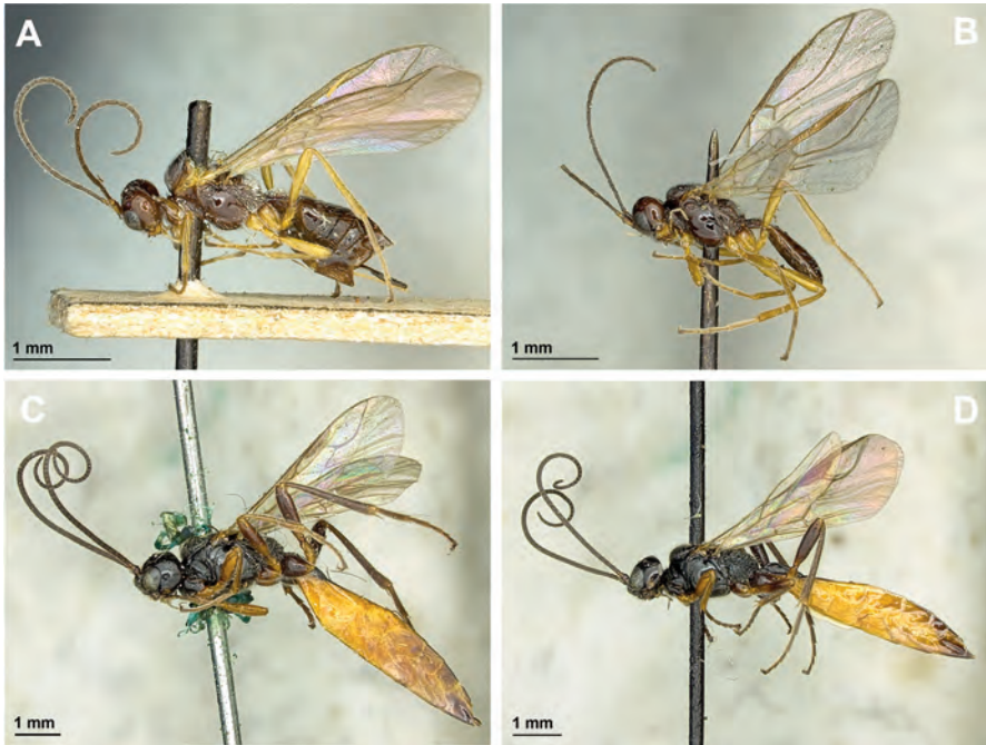
Fig. 2. Habitus lateral view of new Swiss Dacnusiini records. — A, B. Chorebus (Stiphocera) spenceri Griffiths, 1964 (A: female, B: male). — C, D. Eucoelinidea compressa Tobias, 1979 (C: female, D: male).